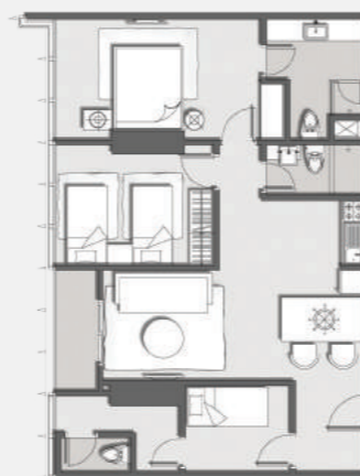
3 BR 150 m 2