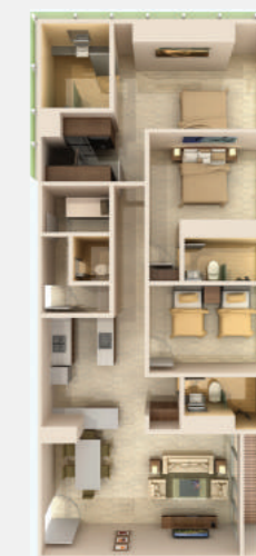
SIGNATURE LEVEL 102 m 2