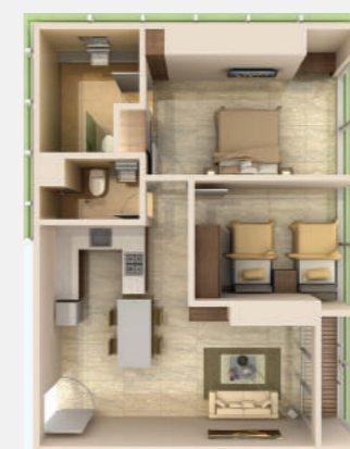
2 BR STANDARD 85 m 2